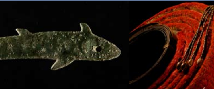
△ 'Money' from Ancient China and the Solomon Islands

The museum is full of unique treasures from the HBOS collections.