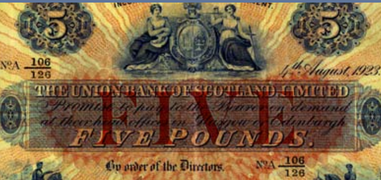
△ Union Bank of Scotland 'sunburst' £5, 1923